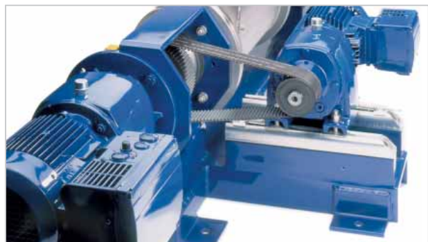
Detail: Ribbon auger drive

protects the grease-filled joints from penetration of the liquid pumped, even in case of maximum vacuum or pressure loading; streamlined design to reduce turbulence and NPSHr.