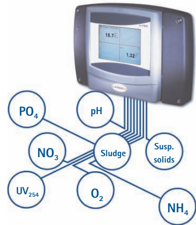
The user-friendly SC 1000 controller communicates with up to eight sensors.

SONATAX sc can be combined with additional sensors through the SC controller. The SC 1000 in particular, with its large touchscreen, graphics function, enhanced data options and telemonitoring (GSM), offers numerous benefits.