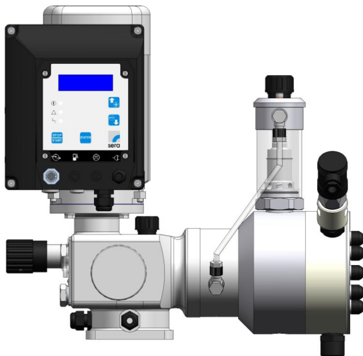
Controllable piston diaphragm pump type C 409.2